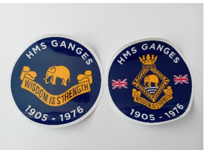
New Design Car Stickers