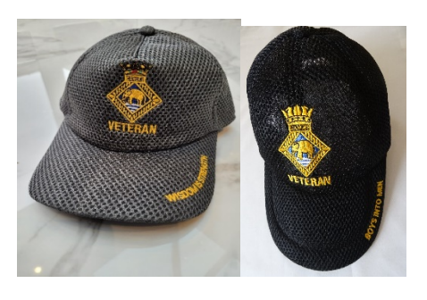
Baseball Caps Black Boys to Men or Dates Grey - Wisdom is Strength £7.99 Each