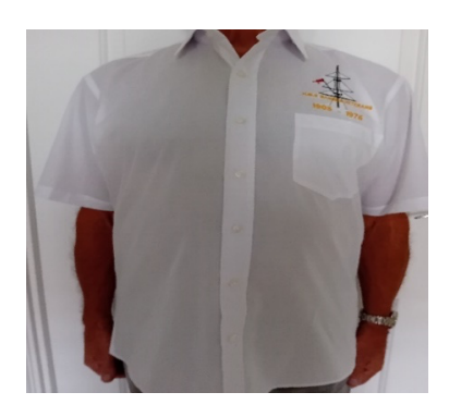
Pilot type Shirt in White and Navy Blue £24.99 each