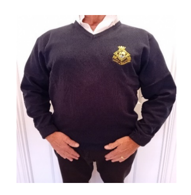
NEW Navy Blue Jumper £25.99