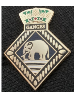
Lapel Pin Badge