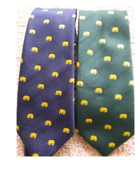
Green or Blue Tie Green £7.99